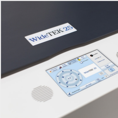
Large color touchscreen for simplified operation