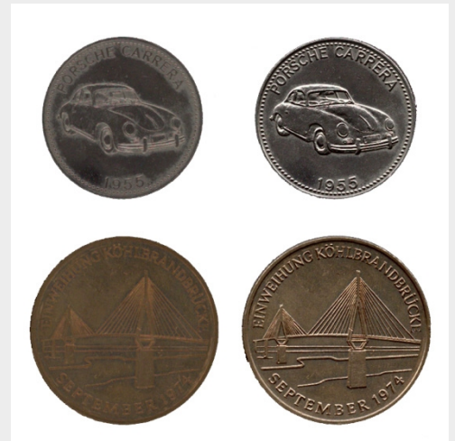
2D scan versus 3D scan, capture all details