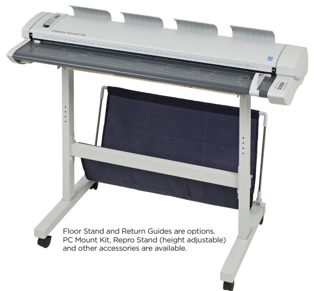
Floor Stand and Return Guides are options. PC Mount Kit, Repro Stand (height adjustable) and other accessories are available.