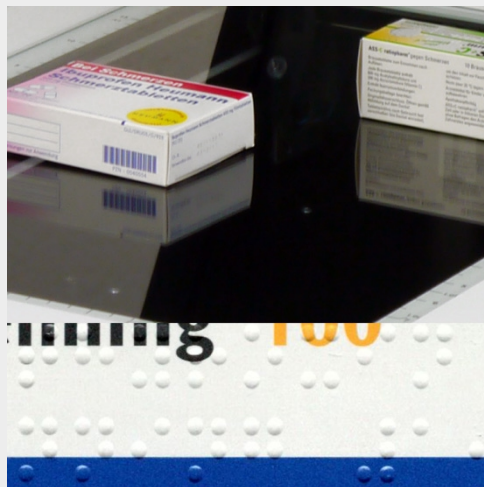
Quality control of print and braille on cardboard