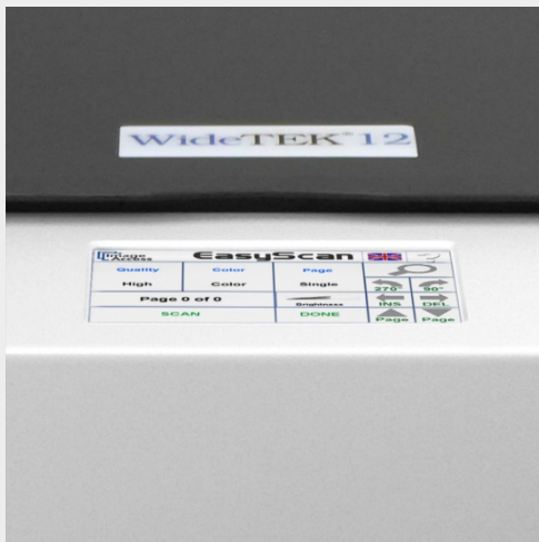
Large color touchscreen for simplified operation