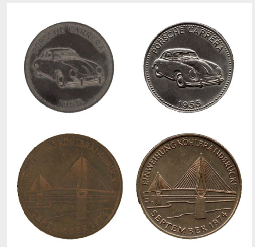
2D scan versus 3D scan, capture all details