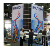
Trade Show Displays