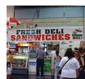
Point of Purchase