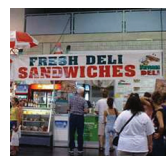
Point of Purchase