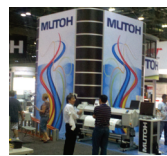
Trade Show Displays