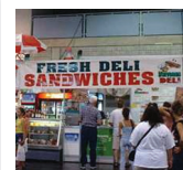
Point of Purchase