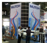
Trade Show Displays

* Must purchase optional bulk ink adapter.