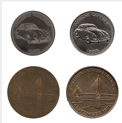
2D scan versus 3D scan, capture all details