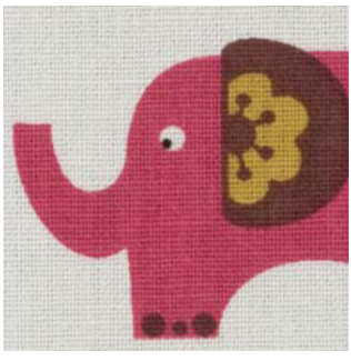
▶ Before applying with the Texture Smoothing function

This software is specifically designed for digital textiles and printings, offering many image improving functions, such as Texture Smoothing, Luminosity Sharpen and Detail Enhancement. ScanWizard DTG is good for using on printing digital patterns in textile, printing, dyeing and ready-to-wear industries.