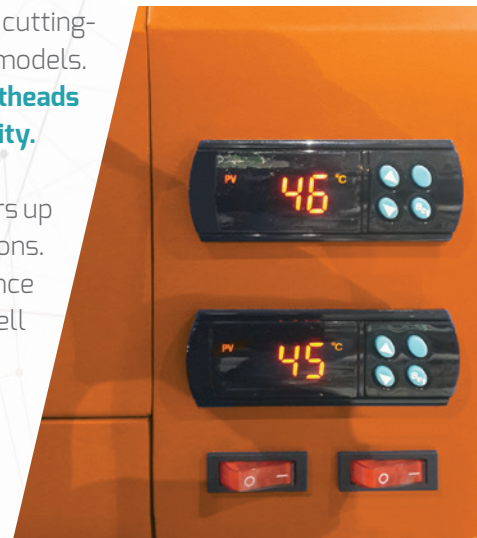
Heater temperature controllers

The high capacity bulk ink system lowers your cost by utilizing 1 liter CMYK inks with 500 ml reserve cartridges. The front heaters and drying fans quickly dry jobs for continuous production when utilizing the printer's automatic take-up system.