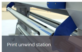
Print unwind station