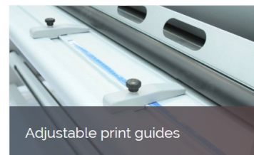
Adjustable print guides